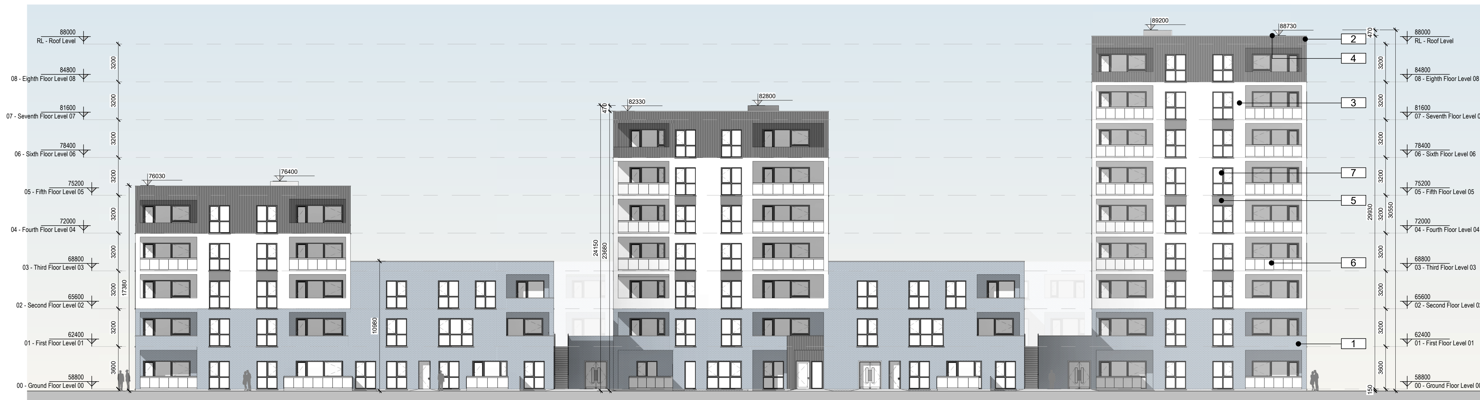
1 SOUTH ELEVATION