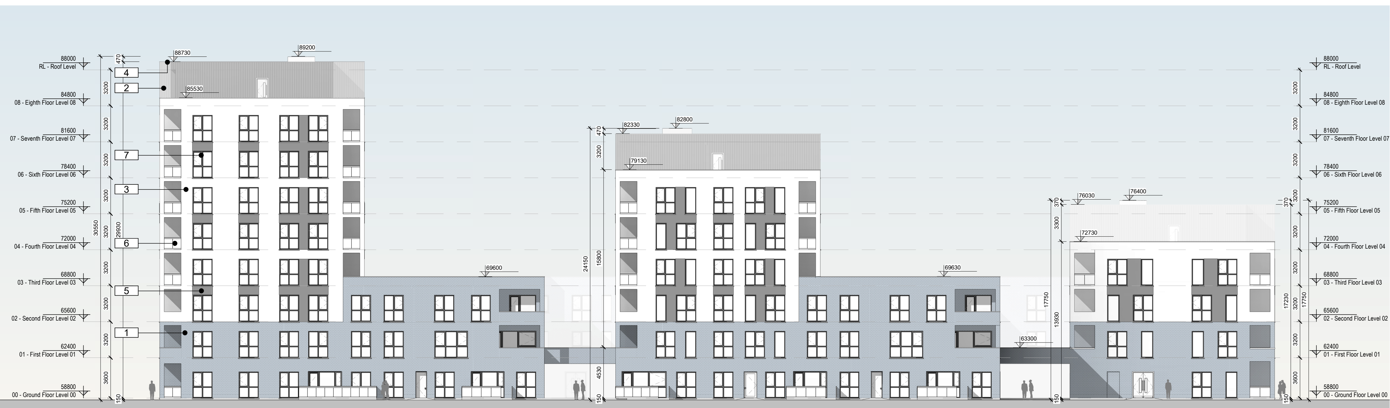
2 NORTH ELEVATION